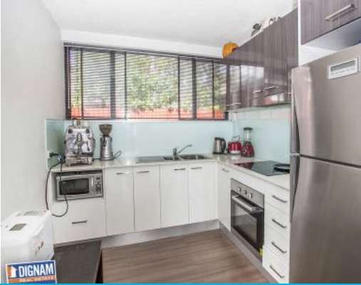
2/2 Church Street Wollongong, NSW