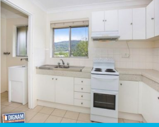
18/133B Campbell Street WOONONA, NSW