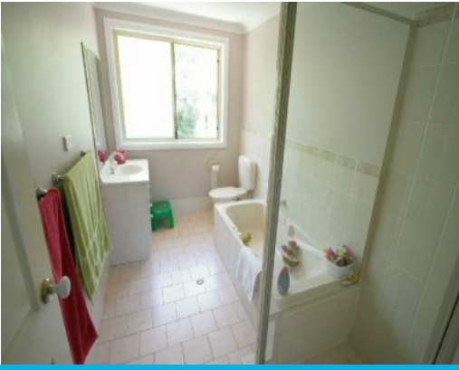
RUSSELL VALE, NSW