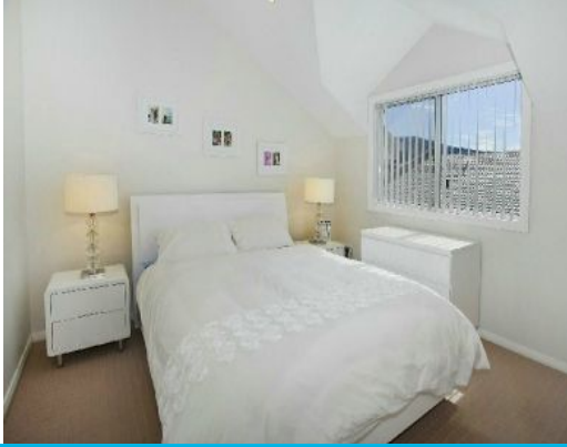
4/40 Cherry Street WOONONA, NSW