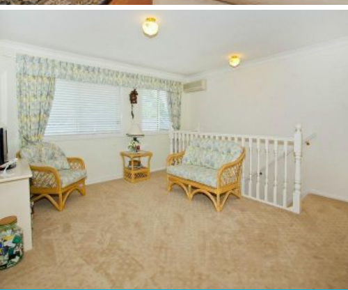
7/2-4 Bean Street THIRROUL, NSW