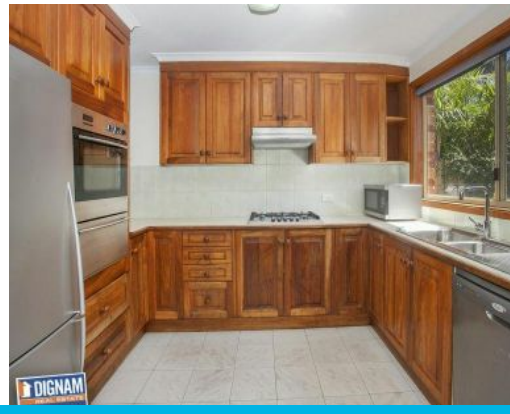
3/1 Bath Street THIRROUL, NSW