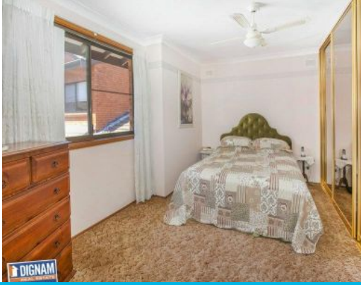
16/32-36 Keira Street WOLLONGONG, NSW