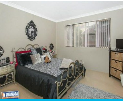
12/30 Market Street WOLLONGONG, NSW