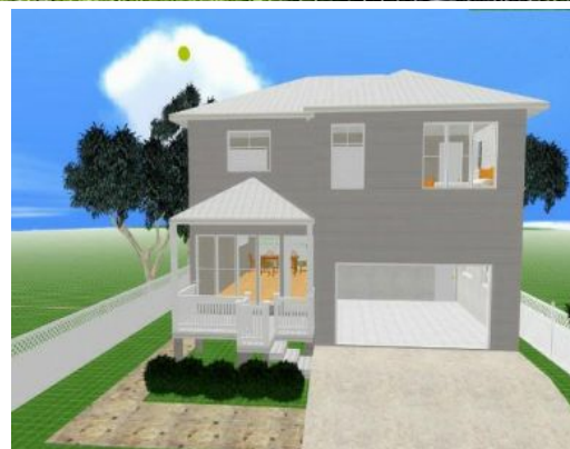
8 Albert Street WOONONA, NSW