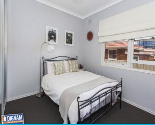
4/35 Virginia Street North Wollongong, NSW