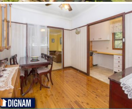
94 Campbell Street Woonona, NSW