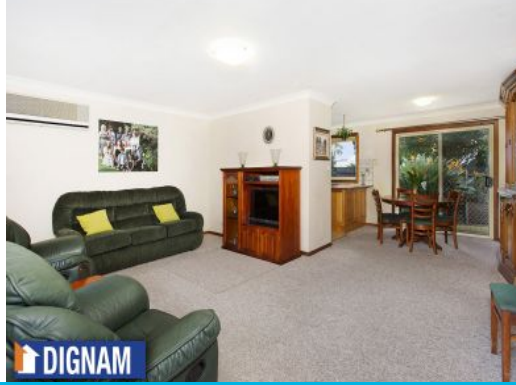
4/1-3 Owen Park Road Bellambi, NSW