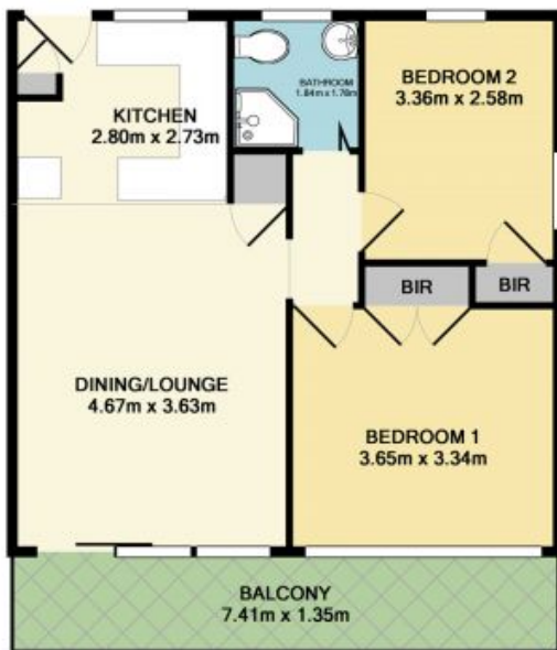
GROUND FLOOR APPROX. FLOOR AREA 73.6 SQ.M.