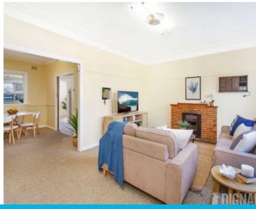
47 Hillcrest Avenue Woonona, NSW