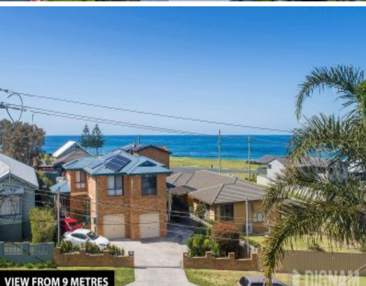
VIEW FROM 9 METRES