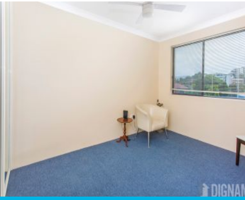
8/70-74 Smith Street Wollongong, NSW