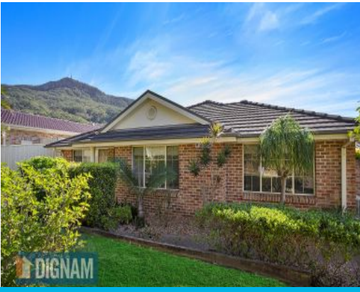
8/20-22 Harrigan Street Tarrawanna, NSW