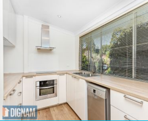
6 Mason Street Thirroul, NSW