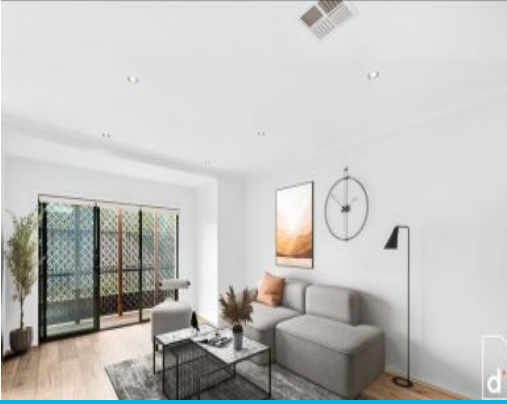
7 Bertone Close Fairy Meadow, NSW