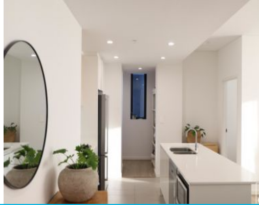
102/14 Auburn Street Wollongong, NSW