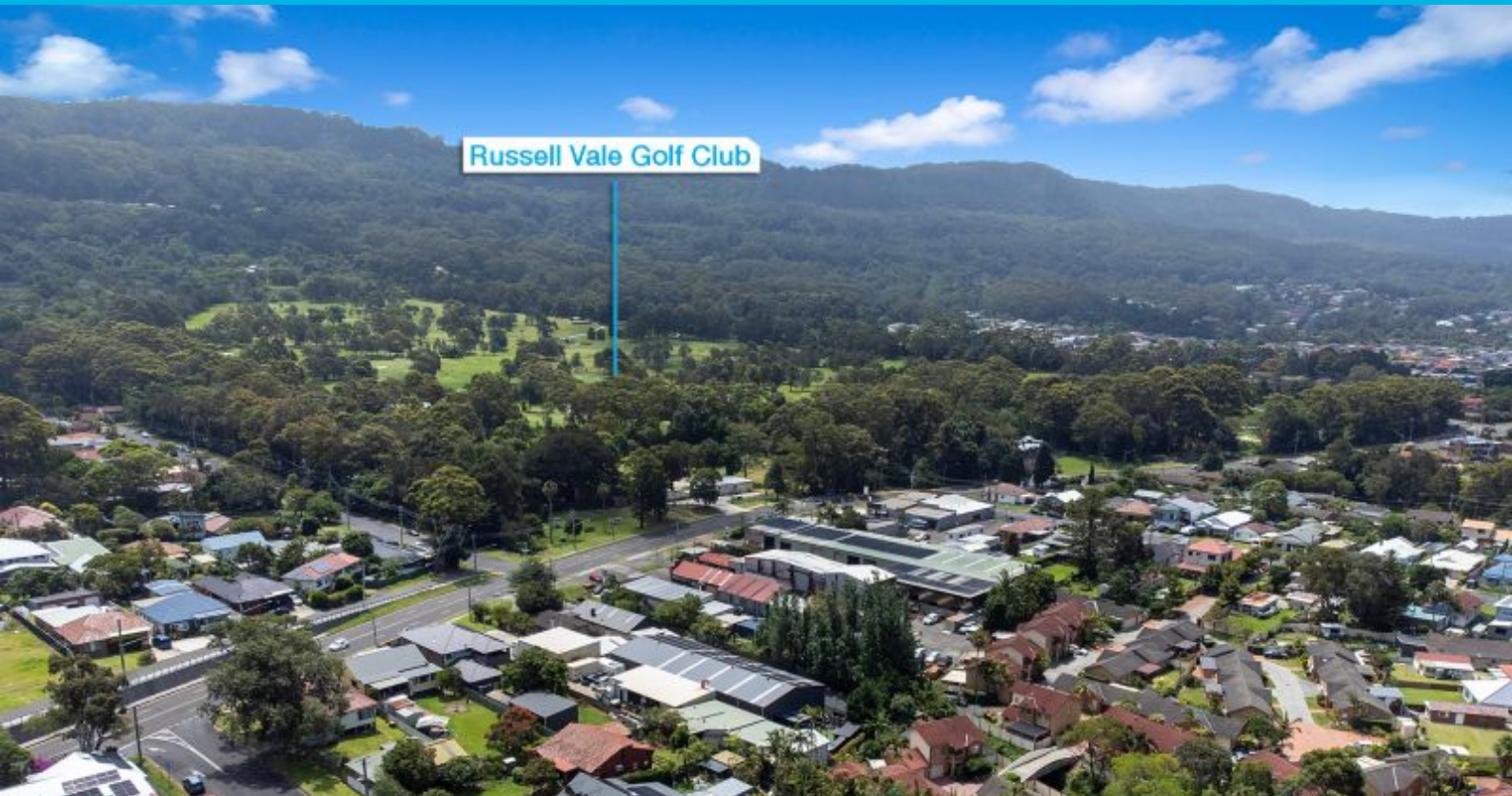
Russell Vale Golf Club